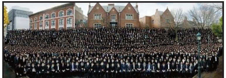
Photo taken this past week of the International Conference of Chabad-Lubavitch Emmissaries. Over 4000 Chabad rabbis convened in Brooklyn this past week.

30TH ANNIVERSARY FOUNDERS DINNER at the Crystal Plaza